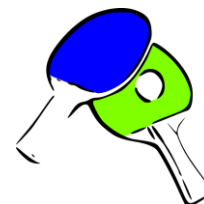
TABLE TENNIS 12.50pm - 1.20pm In the gym